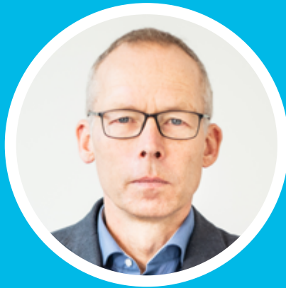
Johan Rockström, Director Potsdam Institute for Climate Impact Research

"Apart from imposing a price on carbon and investing more heavily in R&D, regulation and governance to support the business and technology development are also key."