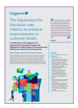
Department for Education