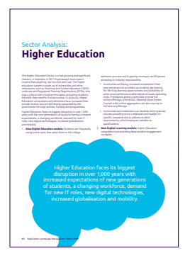
Sector Analysis: Higher Education