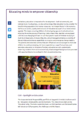
Capgemini Schools Programme