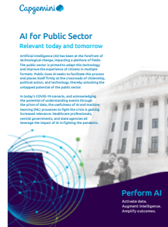
PublicGoesAI and the COVID situation 2020