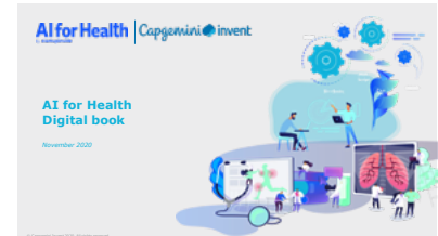
AI for Health 2020