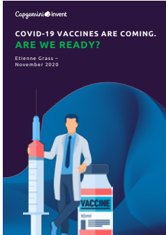
Vaccines are coming – are we ready? 2020